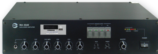
MA Series is available with optional media player