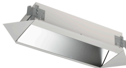
45° 1 ft x 2 ft Fixture