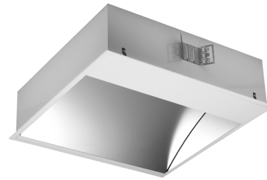
2 ft x 2 ft Fixture