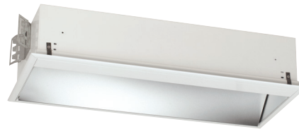
1 ft x 2 ft Fixture