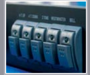
Customisation of chime is available upon request.

Siren activation shall have priority over other chime tones.