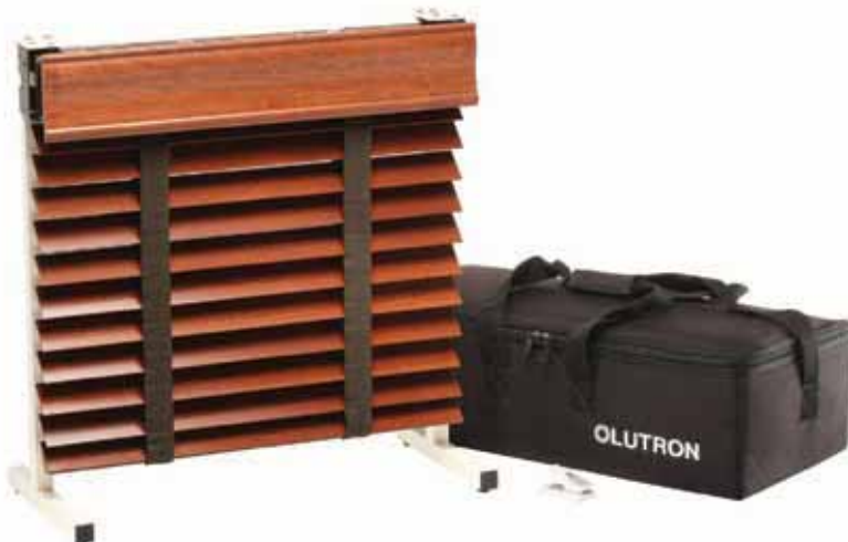
Venetian Demo P/N VENETIAN-DEMO-WD (shown) P/N VENETIAN-DEMO-AL (aluminium demo also available)

All marketing materials can be ordered using the shade configuration tool (SCT). PDFs are also available online at www.lutron.com under Service and Support.