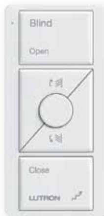
Pico® wireless control

Available for: Sivoia QS, Sivoia QS wireless